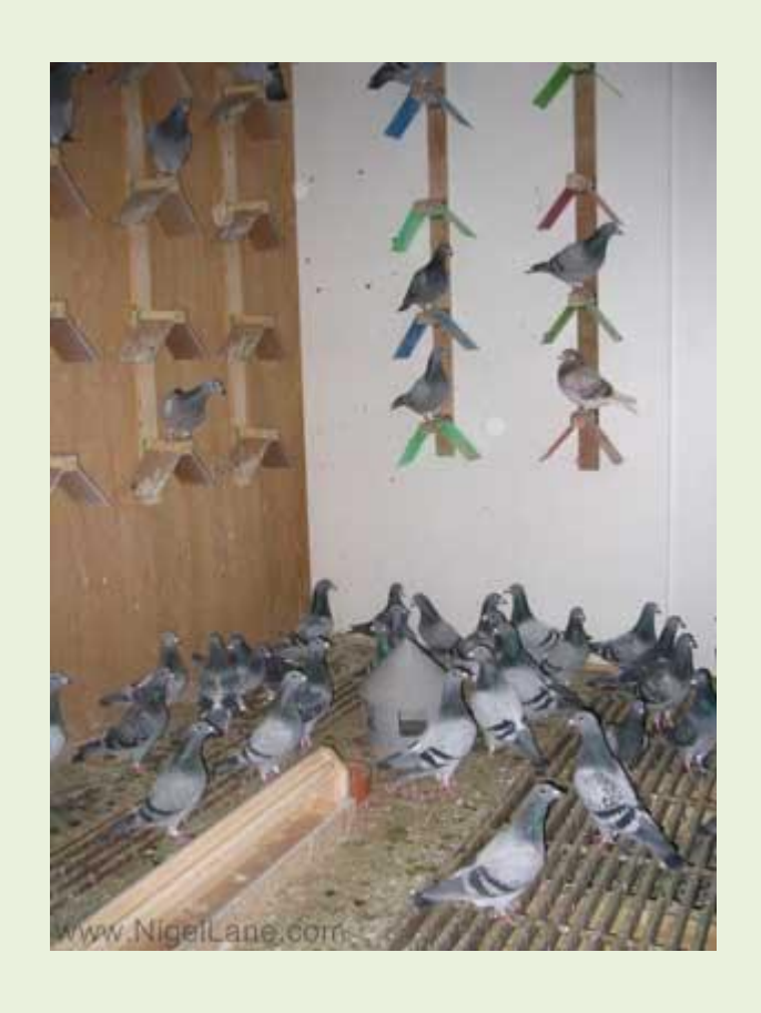
Young bird section.

The programme race consists of five shorter races, which are very much a learning period both for the pigeons and for Frans. They will then go on two middle distance races before a one day long race. Then they are set up for either 3 overnight NPO races or two with Z.L.U. This regime has led to many winners and Championships the over years and to the following in 2006:-