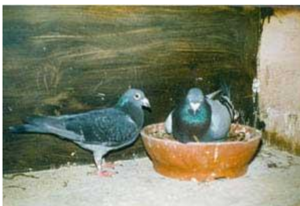
"De 90" and "De Westerhuis"