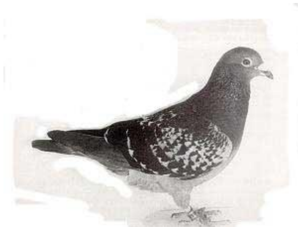
76NL1194042 "De Barcelona" 1st International Barcelona 1980