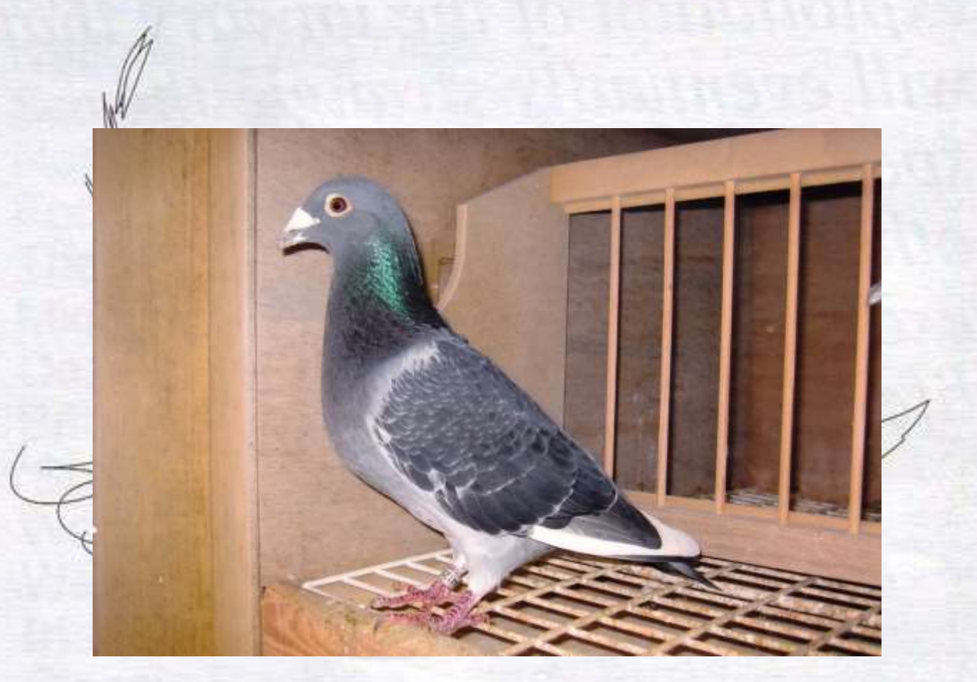
Dark Cheq Cock belonging to Brian Denney York 2<sup>nd</sup> Section K, 6<sup>th</sup> open NFC Tarbes 2013 – 748 miles

If we take time to study this result (which is freely available on the NFC Website) this fact can be verified. The question is why is there such a big gap in distance flown and why did not a single pigeon flying a distance between 568 and 718 miles get into the top twelve in the result? We can justifiably ask further questions and come to further conclusions. We can ask about the sex of the four 700 milers in the top twelve – We can ask were the four 700 mile pigeons superior to all the 600 mile pigeons in the race and if so why? We can also ask - did the extra distance give advantage or did the extra distance handicap these pigeons?