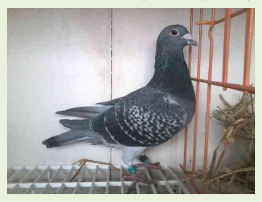
GB08R45948 "DEORWINE" resting in a nest box near to Calais.

Meanwhile the No 1 entry "Deorwine" found his way to Normandy, was rescued by a local farmer on Sunday, retrieved by a local fancier and passed on to a fancier in Calais where he has rested and been breeding until to date. (Circa 2014)